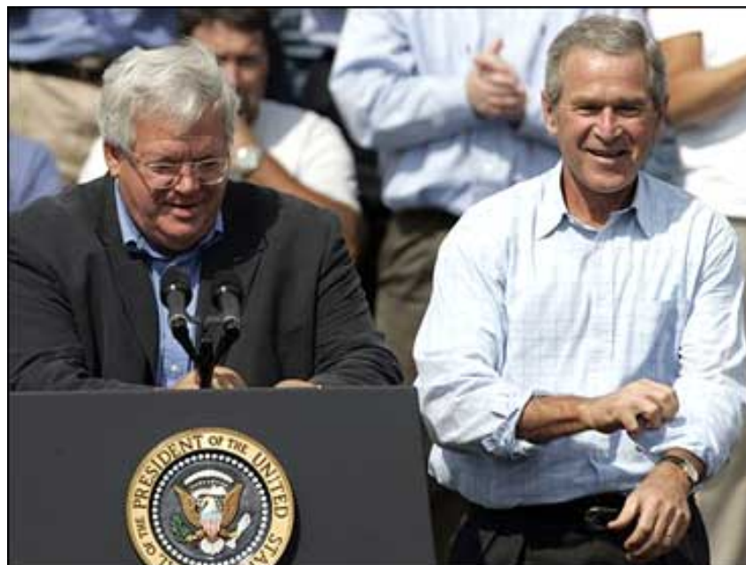
President Bush rolls up his sleeves as House Speaker Dennis Hastert introduces him before signing transportation bill at Caterpillar plant in Montgomery, Ill., Wed., Aug. 10, 2005.