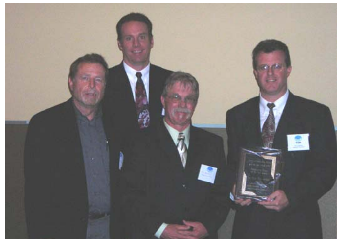
Recipients of the Transportation Project Award West Ridge Road Gateway, Rochester, NY