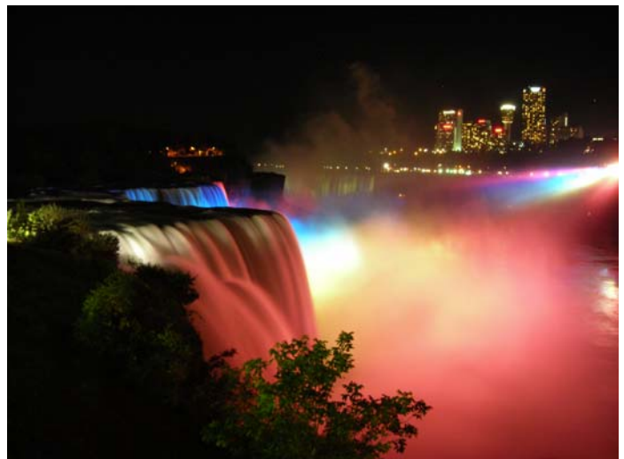
Niagara Falls at Night