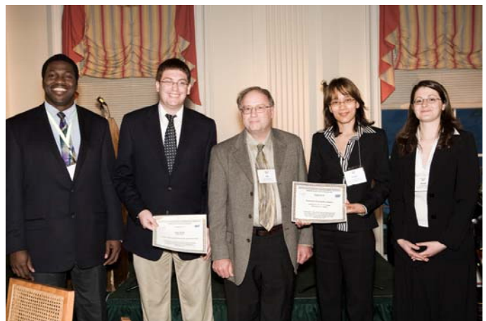
Members of the University of Massachusetts at Amherst award winning student chapter