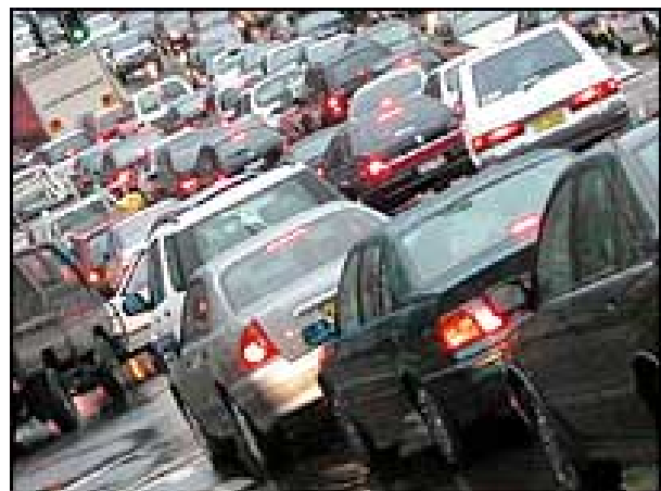
What can we do to prevent this?!

To download a copy of the National Strategy to Reduce Congestion on America's Transportation Network plan, visit: http://isddc.dot.gov/OLPFiles/OST/012988.pdf .